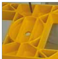
Chassis from ductile graphite iron