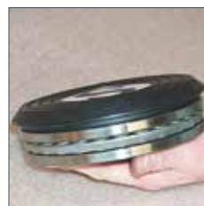
Ball bearing for turning plate