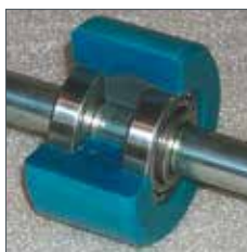
Rollers with ball bearing